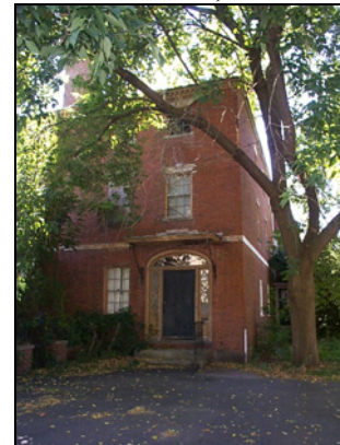
6 Federal Court

In August and September, 2003, The Salem News reported that the City of Salem was spearheading new efforts to help save two endangered Salem landmarks, located at 6 Federal Court and 18 Crombie Street. The Federal Court building includes a brick Federal Style main house, with a detached French Second Empire style carriage house. The Wendt House at 18 Crombie Street is a timber framed, Georgian Style, gambrel roof house, thought to date from the 1780s or earlier, and moved to Crombie Street in the early 19 th century. The Wendt House tops both the local list of Most Endangered historic resources in Salem, and the State's list of Most Endangered Historic Resources. Preservation and restoration of both properties is needed