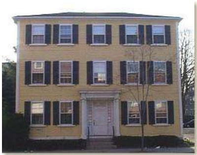
9 North Street