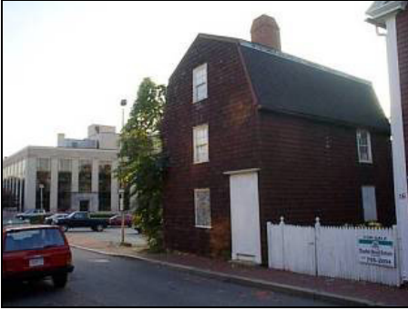
18 Crombie Street

for neighborhood improvement, economic revitalization, and historic preservation.